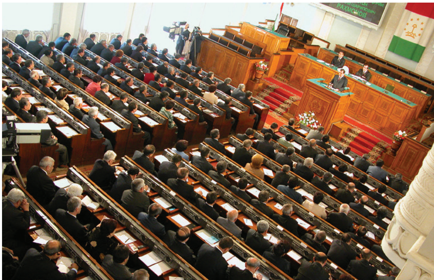
Photo: Tajikistan Parliament, Tajikistan.

Building support for legal and policy reform often requires a long-term strategic effort and sustained advocacy with parliamentarians. Effective advocacy requires an understanding of the parliamentarian's home constituency. This involves understanding how the parliamentarian wields leadership in the community, and identifying key influential supporters as well as potential impediments to action. Civil society allies living in these communities can often provide nuanced information regarding the best approach to engaging with parliamentarians.