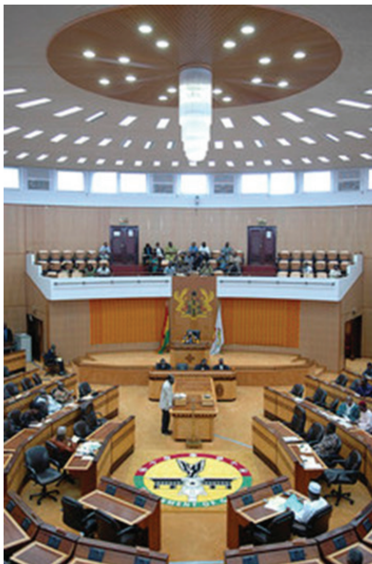
Lawmakers meet during a session of Parliament in Accra, Ghana, June 16, 2006. www.flickr.com/photos/worldbank/5094763376

Direct oversight: Beyond enacting legislation and approving national budgets, most legislative bodies in parliamentary and presidential systems play an ongoing role in overseeing executive branch activities. In some cases, opportunities for direct oversight may arise during the normal legislative process, such as when executive officials are summoned to provide annual reports of government activities and plans for the coming year. Frequently, oversight may occur at the prompting of members of parliament who wish to follow up on issues raised in a briefing, meeting or event. Members of parliament may also be inspired to exercise their oversight authority in response to a media story or at the request of a constituent or advocacy group.